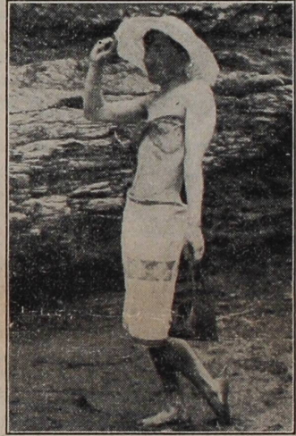
"Tintagel Queen" rejected by King's.

This proved to be of great interest to the public, and tickets sold like "hot cakes." On Friday last, and Monday and Tuesday of this week, a representative of King's was stationed at Greys Monument who distributed free double tickets for the Midnight Matinee to the "Girls of the Year," that is, those pretty girls who happened to be walking past him just then. Did you get, one beautiful?