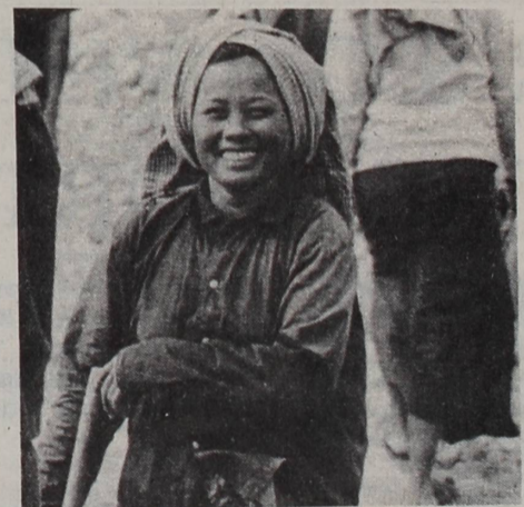
Before the carnage?

Silence could be interpreted as acceptance of aggression and invasion. An international