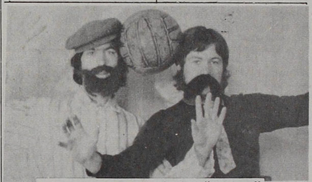
"Peace man, we're the headbangers."