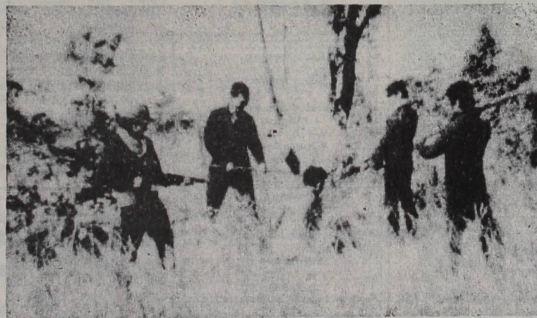
Execution or press con?

A country devastated by war needs to be reconstructed. Democratic Kampuchea was not propped up by the United States and Soviet Union, it did not depend