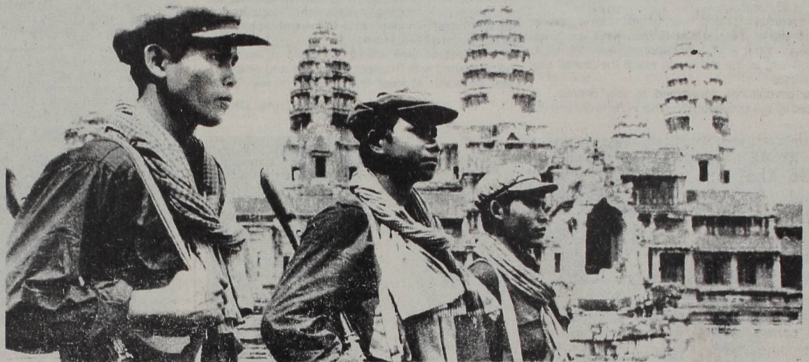
Soldiers from the Cambodian People's Armed Forces.

This 'council' headed by Heng Samrin was installed into power by Vietnamese troops. Its flimsy