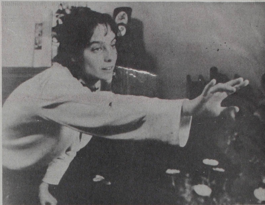
I gotta get off this page . . . I gotta get off this page . . . I gotta get off this page . . .

Kathleen Quinlan as Deborah is very good in a part which most young American actresses would give up their sorority pins for and Bibi Andersson gives her usual strong, thoughtful performance.