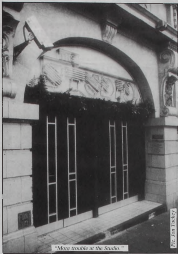
"More trouble at the Studio."