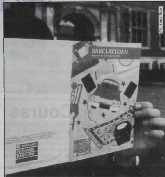
Engrossed in student loans.

The banks' withdrawal leaves in tatters the government's original plan for a scheme administered by