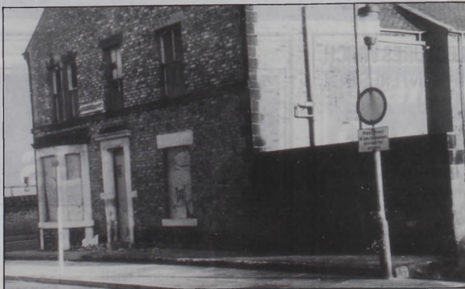
Beaconsfield Street, Fenham.

Sixty break-ins in the Fenham area were reported to the police over the Christmas period - an increase on last year's total. A