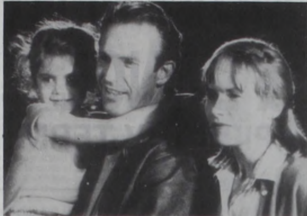
Kevin Costner in 'Field of Dreams'

THEATRE ROYAL (Tel. 2322061). Thurs. 25 Jan.-Sat. 27 Jan. 7 p.m., mats. 2 p.m. CINDERELLA Tickets £3.50-£8. Tues. 30 Jan.-Sat. 3 Feb., 7.30 p.m., mats. Sat. 2.30 p.m. and Thurs. 2 p.m. LETTICE & LOVAGE Tickets £3-£12 GULBENKIAN (Tel. 2329974) Thurs. 25 Jan.-Sat. 27 Jan., 8 p.m. COMPANY Tickets £3.50-£2.75 Wed. 31 Jan. CABARET Tickets £3.50-£2.50 PLAYHOUSE (Tel. 2327079) Thurs. 25 Jan.-Sat. 3 Feb., 7 p.m., mats. Sat. 2.30 p.m. REVENGE OF THE LAMBTON WORM Tickets £3.50-£4.50 LIVE THEATRE (Tel. 2612694) Fri. 26 Jan., 2 p.m. & 8 p.m. HOPPING MAD—LIVE THEATRE COMPANY Sat. 27 Jan., 8 p.m. MIME WITH SPLINTER GROUP