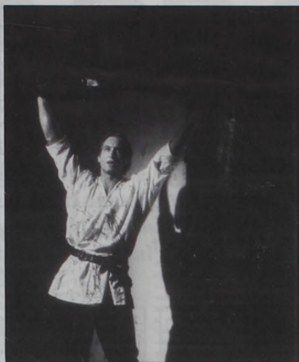
CORIOLANUS (Charles Dance)

"New Writing North" is the first of an exciting series of collaborations planned between the two companies.