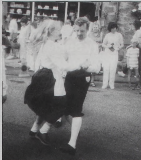
At the Goosefayre, Ovingham 1988.

For those prepared to test the hypothesis that there is life beyond Rockshots, the Studio and Level Two, who wish to broaden your horizons by indulging in something a little less hackneyed, come along. If you have a musical instrument bring that along too. The Festival offers so much diversity you could find yourself trying things you would not, in sane mind and