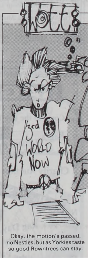
Okay, the motion's passed, no Nestles, but as Yorkies taste so good Rowntrees can stay.

Page 12 Listings "Annabella" and Personal Column