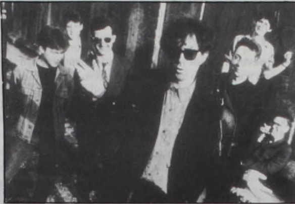
Above: The Blue Aeroplanes Below: 'Five Guys Named Moe'

Tonight, Loop and their endless guitars at the Riverside. Sunday, Chumbawamba bring anarcho-punk to the Riverside, while on Wednesday the Stranglers play the City Ha'