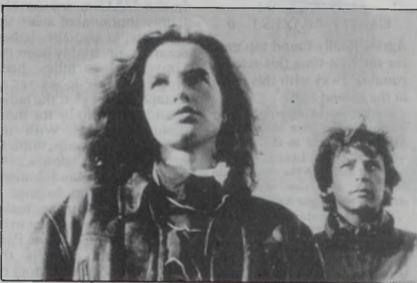
"After Betty Blue comes Roselyne and The Lions"

SIDE GALLERY, SIDE until 4th March RAINDOOR PEOPLE: THE SAAMI OF LAPLAND